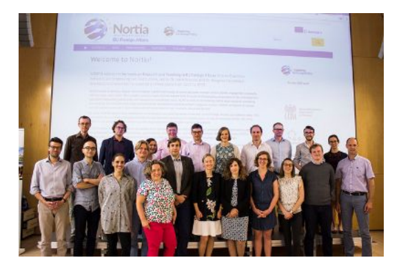
UACES is a member of NORTIA: the Network on Research and Teaching in EU Foreign Affairs - an Erasmus+ network, encompassing ten institutions.

The call for submission for the NORTIA essay competition is now open. Learn more.