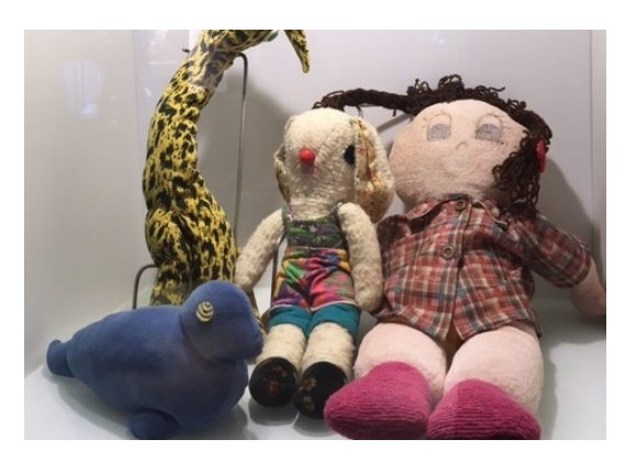
Outreach, Reconciliation and Conflict Sensitivity: The War Childhood Museum in Sarajevo

The UACES Collaborative Research Network 'Europe and the Everyday' reflects on the experience of the War Childhood Museum in Sarajevo. A paper on the subject will be presented at UACES 2018.