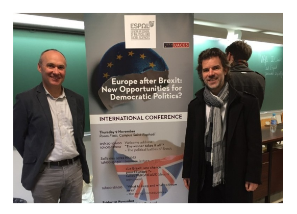
Europe After Brexit: New Opportunities for Democratic Politics?

Call for Survey Participants: Complete the <u>UACES Postgraduate Survey</u> to enter our Prize Draw. Postgraduate and early-career researchers are eligible.