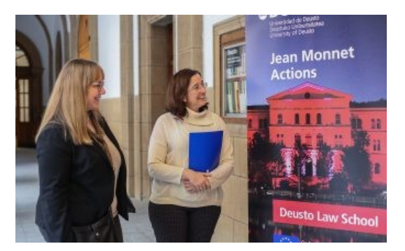
Workshop on Financial Accountability

Scholars and practitioners assembled at the University of Maastricht on the 19<sup>th</sup> and 20<sup>th</sup> April 2018 for the third (and final) scheduled workshop of the UACES