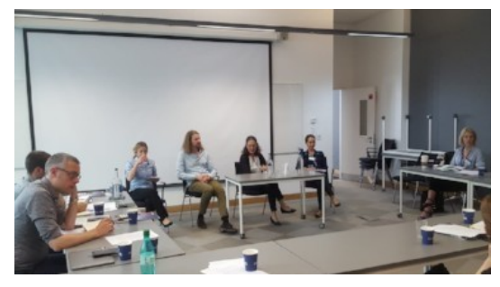
Governance beyond the Anthropocene: Ecological Issues in European Political practice and Thought | Event Report