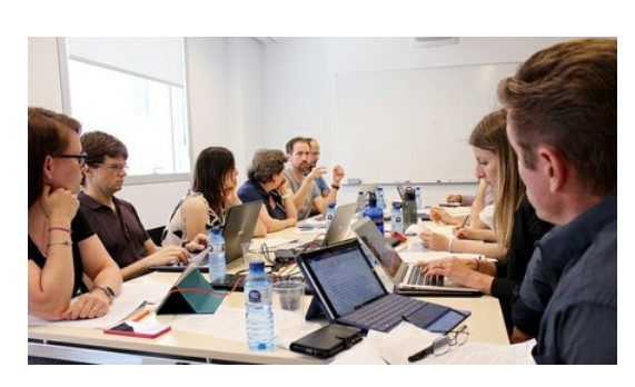
EU-NormCon Trade Politicisation Workshop, IBEI | Event Report