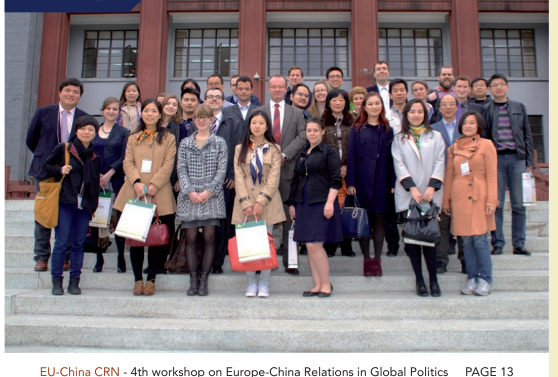
EU-China CRN - 4th workshop on Europe-China Relations in Global Politics