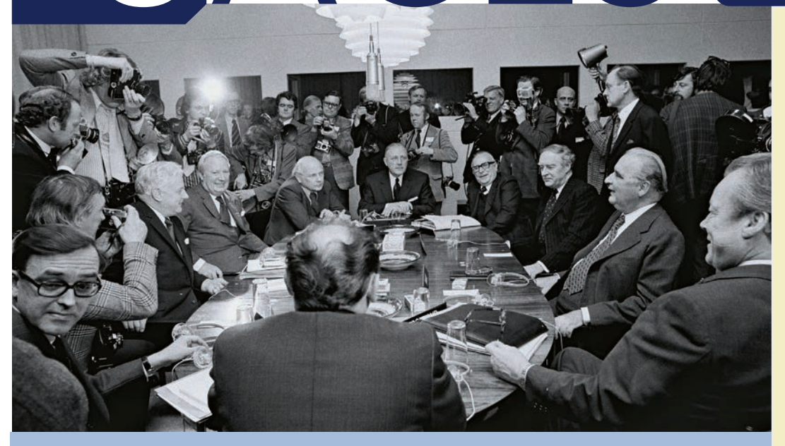
The UK in an Evolving Europe: The Bumpy Road to the First Enlargement. Richard Whitman looks back on the past 40 years. PAGE 15