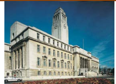
Parkinson Building, University of Leeds

by the Department of Politics and International Studies at the University of Leeds. Too early to say much yet, but we have pencilled in a conference dinner at Leeds City Museum.