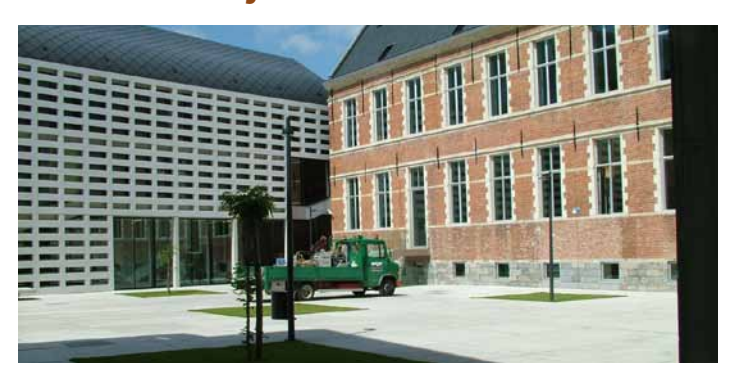
Verversdijk campus, College of Europe, Bruges

As you may have seen reported in the last newsletter, the UK government had announced the withdrawal of scholarship funding for UK residents to study at the College of Europe. The administrations in Wales and Northern Ireland followed suit.