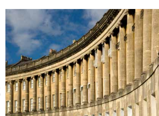
The Royal Crescent, City of Bath

To learn more about Student Forum and to join the EuroResearch email list, go to www.euro-research.eu.