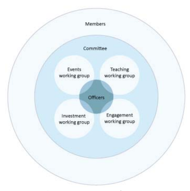
The governance structure for UACES

The Association is governed by a Committee which includes a Chair, a Secretary and a Treasurer. In addition to the Committee, there are working groups which undertake specific tasks. The student members of the Association are represented by the UACES Student Forum.