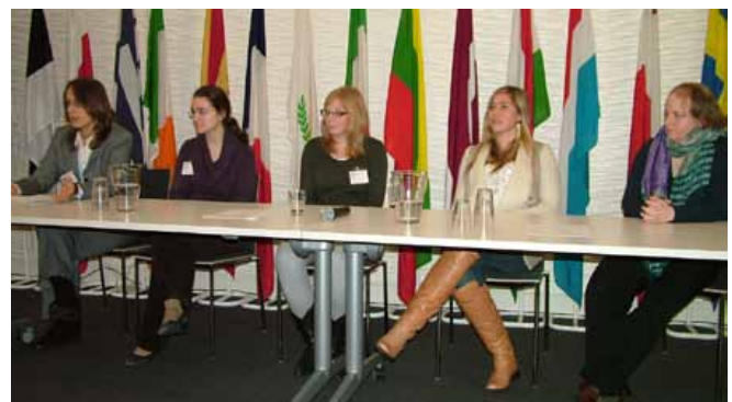
The five candidates standing for election to the Student Forum Committee