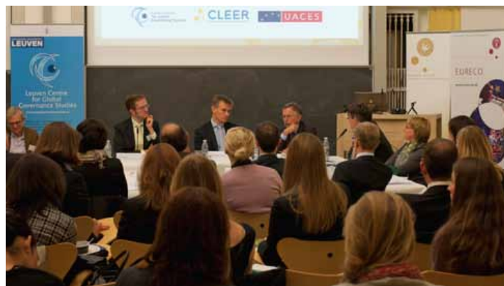
Participants at The Legal Dimension of Global Governance

The outcome of this conference, and suggestions in support of a future role for the EU in global governance, will be published in an edited volume forthcoming with Oxford University Press in 2012.