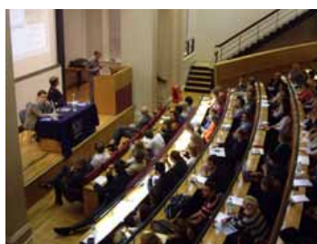
The audience at King's College London